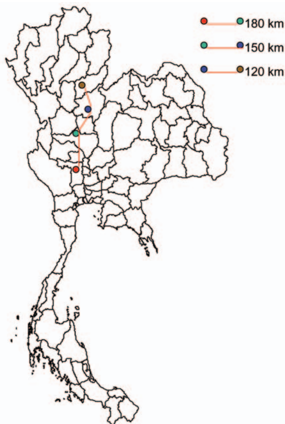
Figure 2. Example of grazing-duck movement. A single flock of ducks was moved 3 times by truck in 1 season in 2004. The size of the flock is 3,000–10,000. The time spent at each site depends on the availability of rice fields at the site: an acre of rice could support 3,000 ducks for 1 to 2 days. The duck owners have agreements with the landowners regarding the time of harvest and the acreage available. One flock could spend as long as 1 month at a single site before being moved to the next.

and mule ducks (a sterile crossbreed of Muscovy ducks and native ducks). If a single case of H5N1 infection is detected in a village, all the poultry in the village are culled. Approximately 1.0 million to 1.5 million ducks were raised as backyard ducks at the beginning of the outbreak in 2004; culling reduced that number to <1 million by August 2005.