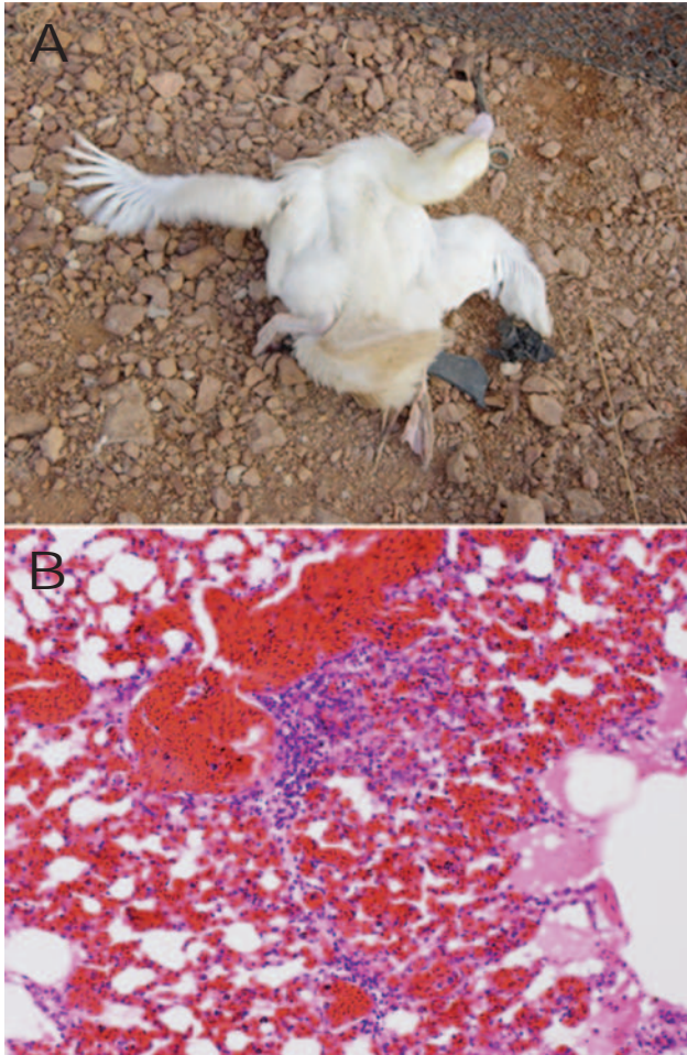
Figure 3. A) A White Cherry Valley duck ( Anas platyrhynchos ), infected with HPAI H5N1 displays nervous signs, convulsions. B) Histopathologic features of the lung of an HPAI H5N1–infected white Cherry Valley duck; infiltration of inflammatory cells in the lung parenchyma (magnification \times 100 ).

ecchymotic or petechial hemorrhage of leg and footpad; serous fluid surrounding the heart, pancreas, liver, and abdomen; cyanosis of the oral cavity; and mild pleural effusion. On histopathologic examination, the most striking lesions were found in the lung, with extensive pneumonia and severe pulmonary edema with hyaline material in the alveolar space and slight mononuclear infiltration in the area surrounding congested vessels (Figure 3B). Nonsuppurative encephalitis with perivascular cuffing of mononuclear cells and gliosis were detected in the brains of ducks that displayed nervous signs. Hyaline degeneration and necrosis of myocardium with mononuclear infiltration were detected predominantly in dead ducks from fast-growing breeds such as the Pekin and white Cherry Valley ducks. Necrotizing pancreatitis with mononuclear infiltration was detected in all affected ducks. Most affected ducks exhibited focal hepatitis, tubulonephritis, splenic lymphoid