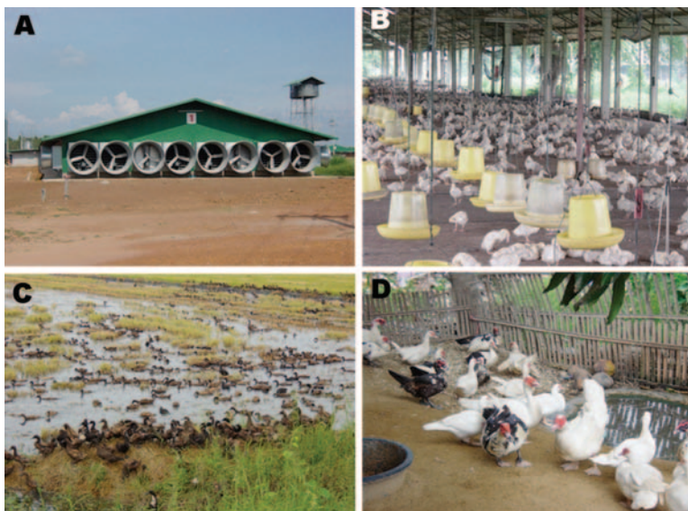
Figure 1. Duck-raising systems in Thailand. A) Closed system with high biosecurity, an evaporative cooling system, and strict entrance control. B) Open system but with netting to prevent entrance of passerine birds. Biosecurity was not strictly enforced. This system is no longer approved for the raising of poultry. C) "Grazing duck raising." Biosecurity is never practiced in this system. D) Backyard Muscovy ducks raised for a family; no biosecurity is practiced in this system

Mixed species of ducks continue to be raised in the backyards of village homes together with other animals, including chickens, geese, and pigs. The duck species raised in backyards include Pekin, white Cherry Valley, Barbary Muscovy, khaki Campbell, native laying ducks,