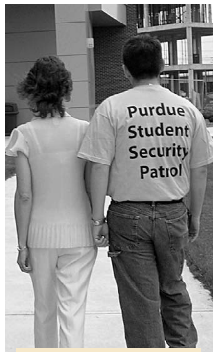
SAFE WALK PROGRAM Phone: 494-SAFE (494-7233)

Participants take part in "shoot-don't shoot" scenarios on a life-sized interactive computer simulator.