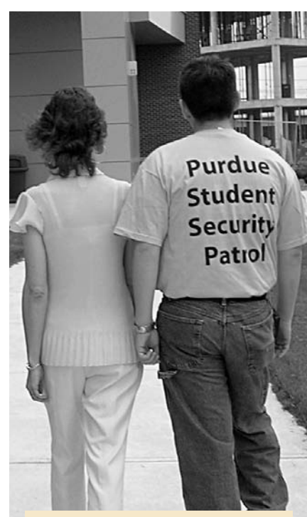
SAFE WALK PROGRAM Phone: 494-SAFE (494-7233)

Participants take part in "shoot-don't shoot" scenarios on a life-sized interactive computer simulator.