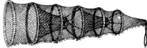
Non-lethal, Baited Hoop Trap

To remove the invasive red-eared sliders from the ecosystem, an intensive trapping program is being conducted within Montezuma Well. Using non-lethal baited hoop traps (pictured above), park scientists hope to capture every red-eared slider in the well, and as many Sonora mud turtles as possible.