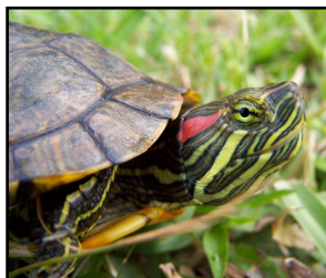
Red-eared Slider ( Trachemys scripta )