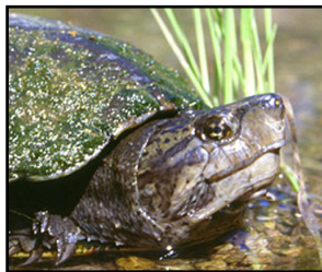
Sonora Mud Turtle ( Kinosternon sonoriense )

Red-eared sliders caught in the hoop traps are “adopted” for use in public displays and school classrooms, with information provided on the biology of the turtles and why they were removed from Montezuma Well. This effort will help educate children and adults about the problems caused by releasing unwanted pets into areas where they do not naturally occur.