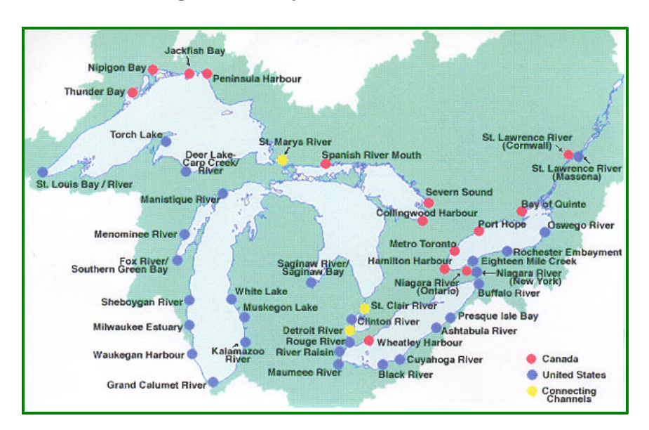
Figure 1: Forty-Three Areas of Concern

Toxic sediments is one of the major issues affecting all U.S. and shared areas of concern. While costs of remediating toxic sediments vary widely, it can cost on average $5.6 million to remediate sediments in one area of concern. In addition, Superfund sites impact about half (22 of 31) of the areas of concern, further complicating the issues being addressed. See exhibit 3 for a detailed table on the status of RAPs.