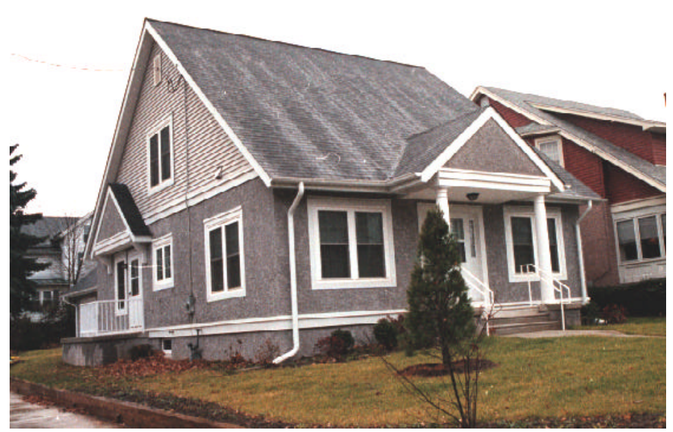
After - $277,694