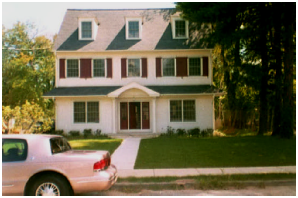
After - $507,878