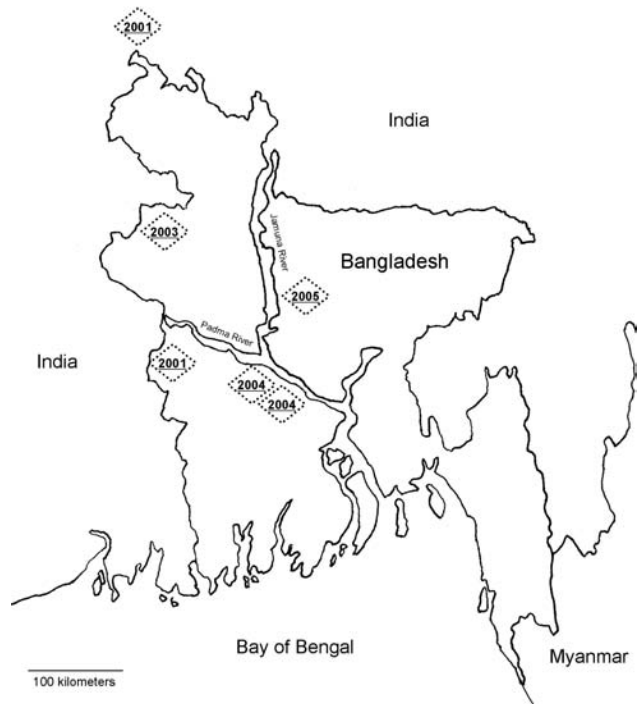
Figure 1. Location and dates of confirmed Nipah virus outbreaks in and near Bangladesh.

An experienced anthropology team conducted in-depth interviews with the families of each case-patient. The objectives were 1) to explore potentially relevant exposures; 2) to assist in framing questions for the case-control questionnaire within the context of the activities, understanding, and language of local residents; and 3) to identify appropriate proxy respondents for each case-patient. Topics covered in the interviews included details on expo-