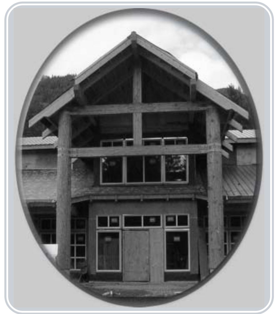
The new Detroit Ranger District office is expected to open July 2003

The U.S. Department of Agriculture (USDA) prohibits discrimination in all its programs and activities on the basis of race, color, national origin, gender, religion, age, disability, political beliefs, sexual orientation, and marital or family status. (Not all prohibited bases apply to all programs.) Persons with disabilities who require alternative means for communication of program information (Braille, large print, audiotape, etc) should contact USDA's TARGET Center at 202-720-2600 (voice and TDD). To file a complaint of discrimination, write or call (202) 720-5964 (voice or TDD). USDA is an equal opportunity provider and employer.