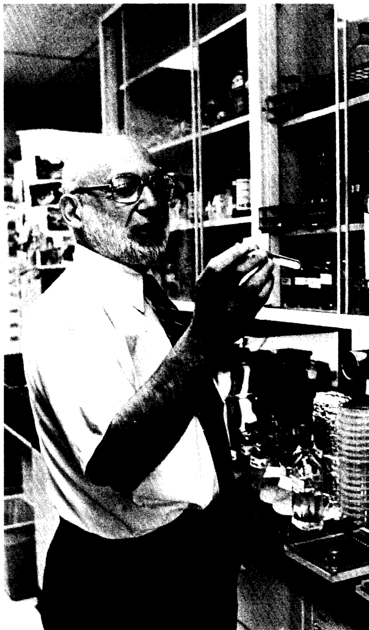
Nobel laureate Dr. Joshua Lederberg, recently appointed president of Rockefeller University, at his laboratory at Stan-

His interest in improving communication among scientists, the general public, and government policymakers has prompted Dr. Lederberg to write extensively for lay audiences. Among his publications are articles distributed by the Washington Post Syndicate on the social impact of scientific programs.