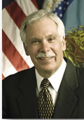
Ed Schafer Secretary of Agriculture

For more than 70 years, USDA Rural Development's mission has been to deliver a future that brings expanded economic opportunities and an improved quality of life for rural residents.