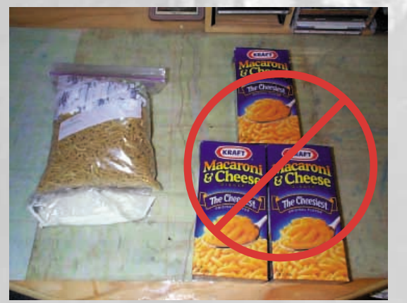
Food with packaging removed takes up less space and reduces trash