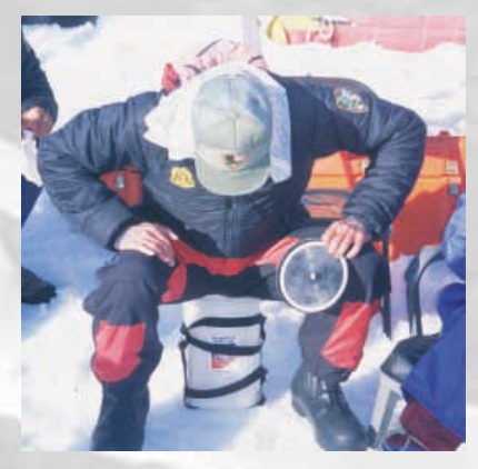
Making a deposit in the CMC