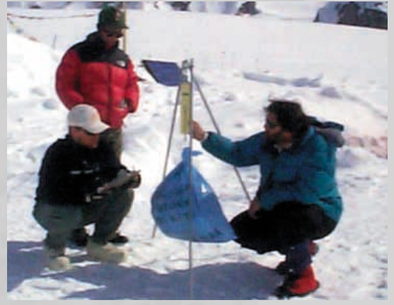
Your trash may be inspected and weighed by Park Rangers