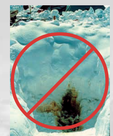
Open Pit toilets are illegal