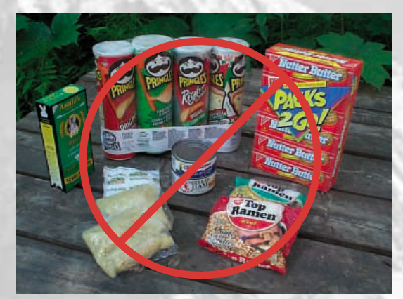
Remove all commercial packaging