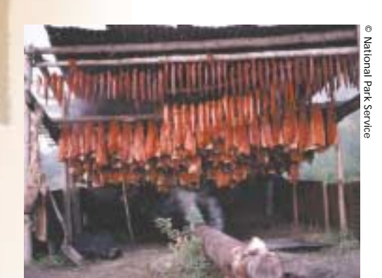
Fish are harvested year-round in many parts of Alaska.