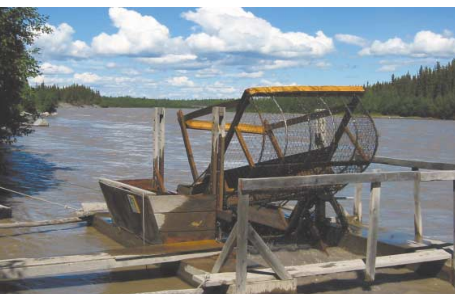
Fishwheels, like this one on the Copper River, are an effective way to catch fish.