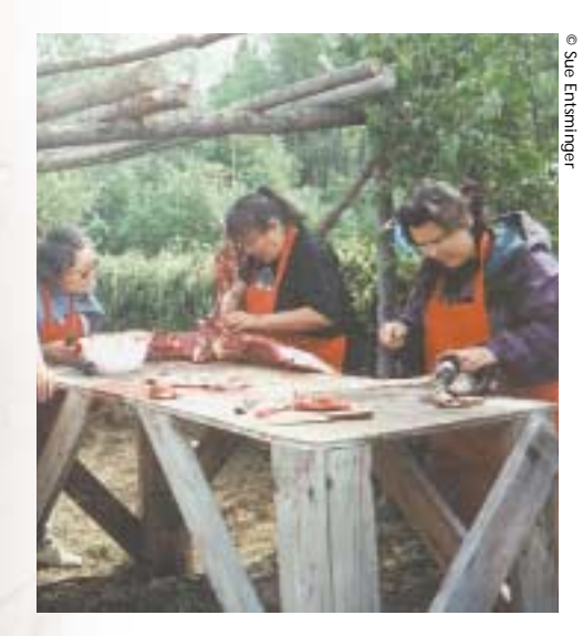
The subsistence lifestyle calls on all members of the community to participate and share the natural resources harvested.