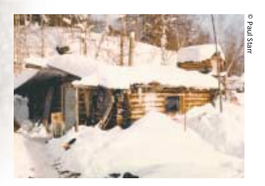
Seasonal cabins are commonly used when trapping.