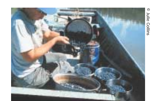
Berries are used to make juice, jam and syrup.