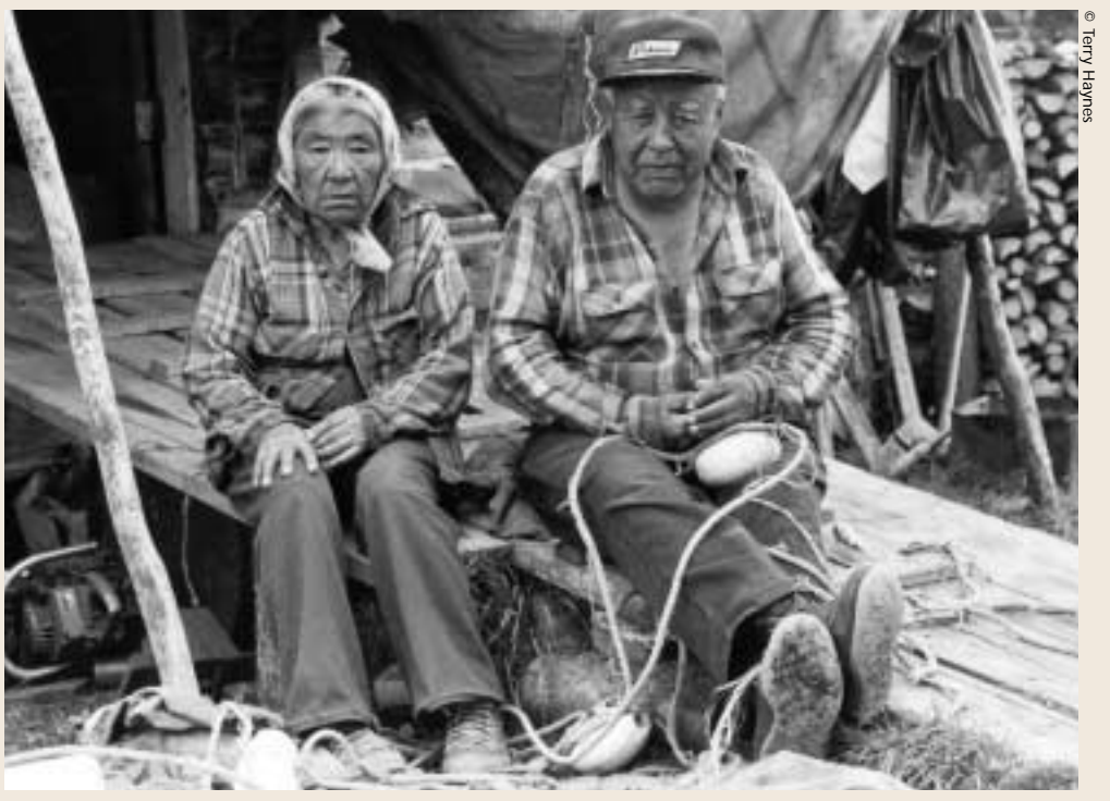
Some methods of harvest have changed over the years but many remain intact. Nets and hand lines are efficient means of harvesting fish.