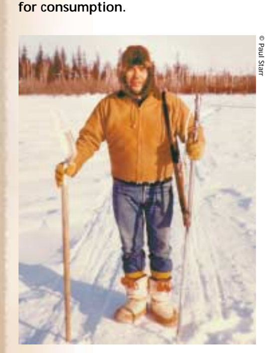
Winter is also an active time for trapping.