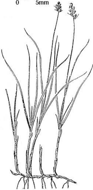
Carex simulata . (A) Inflorescences, (B) pistillate scales, (C) perigynia, (D) achenes. B through D: Left—dorsal view; right—ventral view.