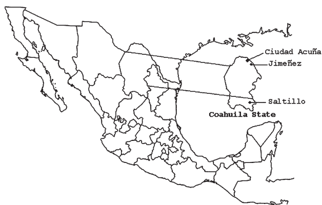
Figure. Geographic location of West Nile virus study sites in Coahuila State, Mexico.

A horse from the Ciudad Acuña ranch died October 17, 3 days after being observed with neurologic signs. The case was not reported immediately, and we were unable to obtain a tissue specimen postmortem. On December 19, with the assistance of a local veterinary practitioner, we sampled 14 horses at this site, 5 of which had developed neurologic disease in mid- to late October. Clinical symptoms included ataxia, weakness of limbs, trembling, and anxiety. All five horses survived. The horses with clinical signs were from 1 to 5 years of age; three were male, and two were female. Ages and sexes of horses without clinical symptoms were not documented. The veterinarian reported a great abundance of mosquitoes in the area. Another six horses were sampled in Jiménez and four in Saltillo, none of which had signs of illness. According to