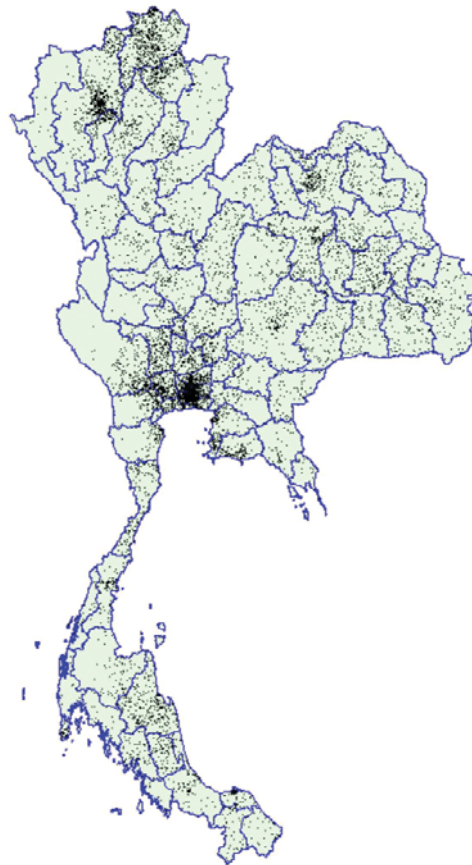
Figure 1. Dot density map of young men who tested positive for HIV at time of entry into the Royal Thai Army, Thailand, November 1991–May 2000. Each dot represents one man. Location of dots based on recruit's residence during the previous 2 years. Data on recruits entering in November 1993 and May 1994 are not available.

Previous analyses conducted at the province level identified regional variation quite clearly, but at a less detailed level (3,4). The maps from our study indicate considerable variation even to the district level of analysis, which suggests important local factors may be at work in determining rates of transmission. The HIV epidemic in Thailand seems to have largely missed some districts and devastated others, even within the same province. Chiang Mai and Chiang Rai Provinces are examples of this phenomenon. These maps also show that, although the growth of the epidemic has slowed in most parts of the country, the epidemic has not decreased in some districts in south Thailand. Choropleth maps best demonstrate the changing prevalence of HIV among recruits from each district. The dot map best demonstrates the intensity of the epidemic within and across provinces. Both types of imagery are