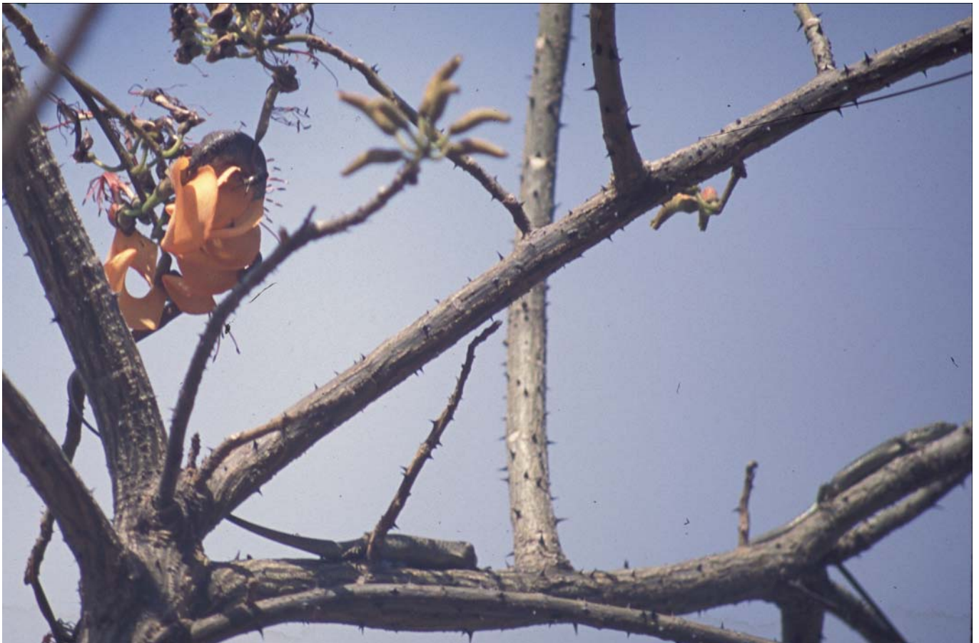
Fig. 2. Three Noronha skinks ( Euprepis atlanticus ) on the same mulungu tree ( Erythrina velutina ), the largest skink visiting the flowers (left) and the two lesser ones lingering on neighbour branches (below centre and right).