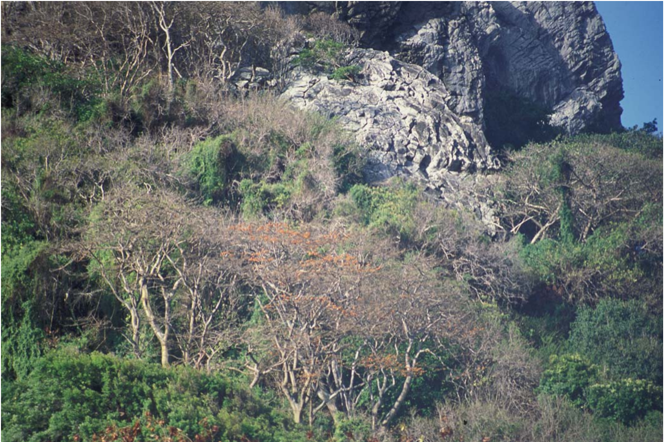
Fig. 3. A small group of blooming mulungu trees ( Erythrina velutina ) in the rocky landscape of Fernando de Noronha Archipelago.