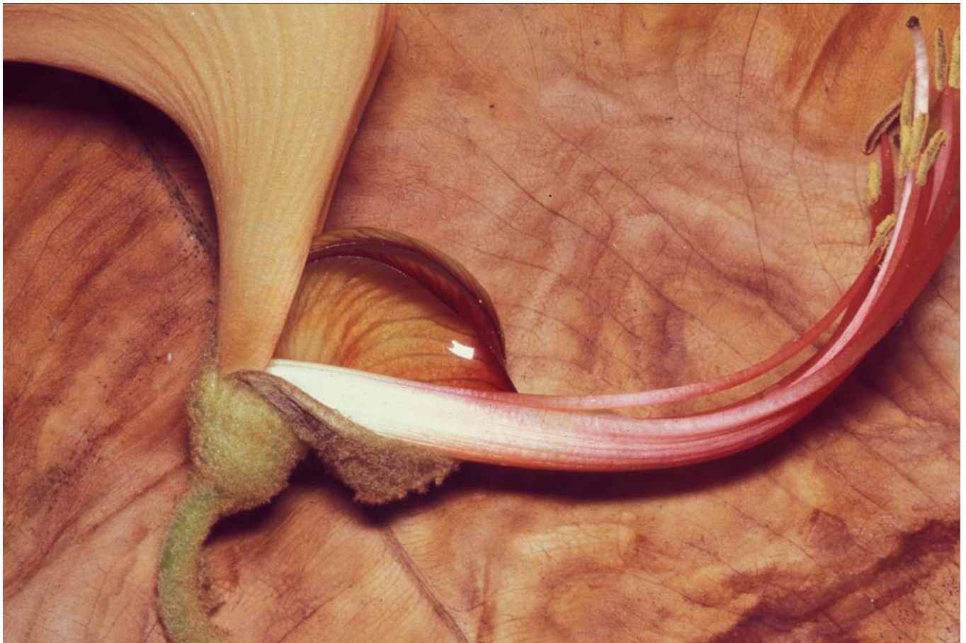
Fig. 4. A partly dismantled flower of the mulungu tree ( Erythrina velutina ) to show the large amount of nectar that accumulates at the corolla's base.