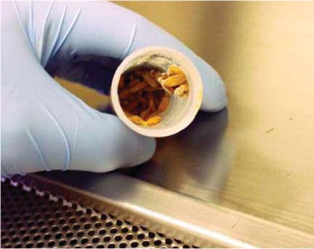
Figure 2. A sample of rodenticide that resembles grains of rice but contains pathogenic Salmonella enterica serotype Enteritidis.

still used despite information about the public health hazards, we conducted a literature search with the keywords “ Salmonella ” and “rodenticide” (National Library of Medicine, http://www.ncbi.nlm.nih.gov ). We found 10 articles, in addition to the recent public health publications discussed above (2,5); none addressed the public health hazards of Salmonella -based rodenticides. Many of the reference materials we used to prepare the present article were not written in English or were not retrievable from current electronic databases. The continued use of Salmonella -based rodenticides may likely be related to the fact that the content of important but dated scientific papers is unlikely to be known to current decision-makers.