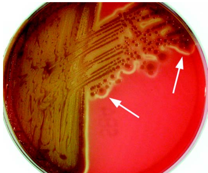
Figure 2. Photorhabdus isolate from patient 2 after 5 days' growth at room temperature on sheep blood agar. Arrows indicate the characteristic thin line of “annular” hemolysis surrounding the colonies.

Publication of information about these two cases brings to a total of 12 the number of human infections with Photorhabdus spp. documented in the medical literature (Table 2 and Figure 3). The clinical picture described in the 12 cases has generally been one of localized or more commonly multifocal skin/soft tissue infection. Such infection has had a tendency to relapse. The disseminated distribution of skin/soft tissue infection in several cases suggests hematogenous spread. Bacteremia was documented in 4/12 case-patients. Cough was