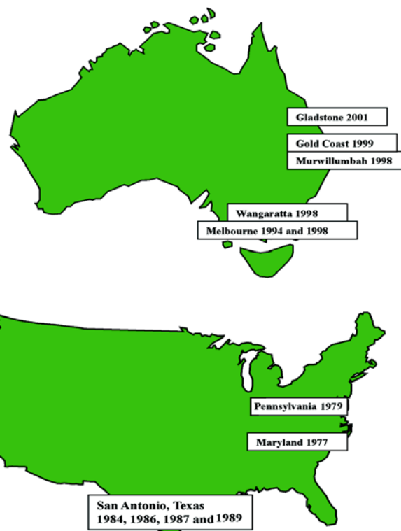
Figure 3. Australian and American clinical isolates of Photothabdus .

Photothabdus spp. have never been shown to live freely in soil, although they will survive in soil under laboratory conditions (8). Photothabdus spp. have only been isolated naturally from two nonclinical sources: insect-pathogenic nematodes