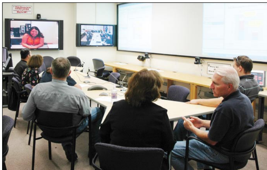
Laboratory employees use the video teleconferencing room at the Research Library.

• It is available at no cost to all Laboratory badge holders, including foreign nationals.