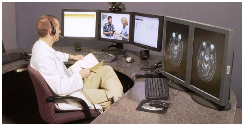
Telemedicine is a specialty of the University of Texas Medical Branch, recipient of a Framework award.

At Brown , students will be offered a set of foundation courses, intensive faculty mentoring and a foreign site experience.