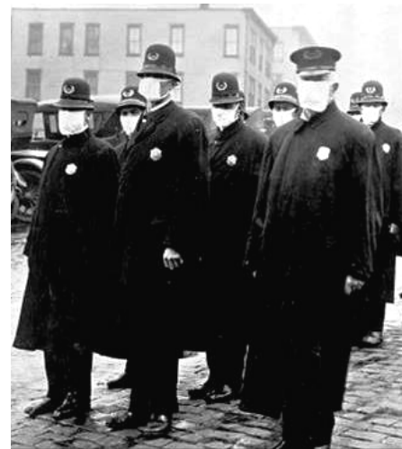
Seattle police try not to catch the flu during the 1918-1919 pandemic.

The risk of death was reduced between 56 percent to 89 percent. At one base, a regiment that had transferred in from Hawaii where soldiers were exposed to the spring