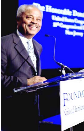
Rep. Donald M. Payne, D-N.J., chairman of the House Foreign Affairs subcommittee on Africa was cited for his global health

The Fogarty International Center’s 40th anniversary gala brought together leaders from Congress, federal agencies, science, advocacy groups, the diplomatic corps and businesses with interest in global health issues.