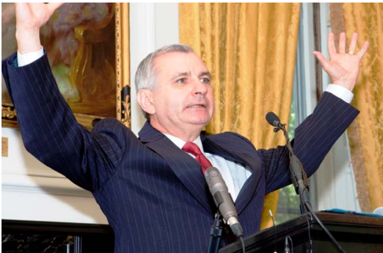
Sen. Jack Reed, D-R.I., describes the wide bow ties that personified the Center’s namesake, the late Rep. John E. Fogarty.

As part of its 40 th anniversary commemoration, the Center celebrated its close ties to Rhode Island—birthplace of its namesake—with a recent grant announcement at Brown University.