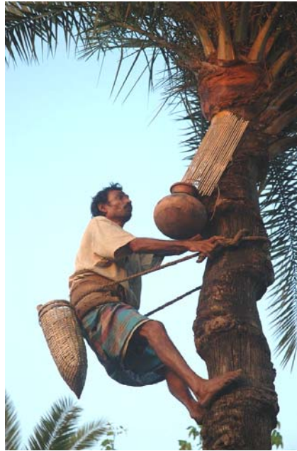
Collecting the sap of date palms to sell as a sweet drink in Bangladesh may be a risk factor for bat-to-human transmission of the Nipah virus.

pathogens.