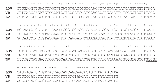
Figure 4. Nucleotide alignment of a segment of open reading frame (ORF) 1b of lactate dehydrogenase-elevating virus–P, porcine reproductive and respiratory syndrome virus VR-2332, and porcine reproductive and respiratory syndrome virus–Lelystad virus beginning at nucleotides 1169, 1165, and 1165, respectively. *Indicates identical nucleotides. Degenerate primer sets for polymerase chain reaction were previously made to the underlined segments (41).

An approach that is more suitable to detect LDV-PRRSV intermediates is reverse transcription-polymerase chain reaction (RT-PCR) with primers to highly conserved genomic sequences, for example, in a segment of the RNA polymerase domain upstream of the nidovirus characteristic SDD protein sequence (Figure 4). This nucleotide segment exhibits 53% identity between LDV, Lelystad virus, and VR-2332 (118/224 nucleotides; amino acid identity of the encoded protein segment is even higher, 75%). This segment contains short segments with complete nucleotide identity (Figure 4, stars); in addition, 25, 30, and 31 nucleotides are identical for LDV and VR-2332, LDV and Lelystad virus, and Lelystad virus and VR-2332, respectively, indicating again the close, but distinct, relationship between LDV and both Lelystad virus and VR-2332. My laboratory has previously used degenerate primer sets of this region designed on the bases of LDV, equine arteritis virus, and Lelystad virus sequence information (Figure 4) that detected not only the genomes of these three viruses but also those of VR-2332 and simian hemorrhagic fever virus, for which no sequence information was available at the time (41). The additional advantages of the RT-PCR approach are that this method can be readily applied to