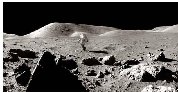
Figure 1. Comprehensive survey of lunar sites will require systems capable of traversing a variety of terrain and mapping at a range of scales.

This detailed characterization will need to be carried out at a variety of sites, including possibly over difficult terrain or in locations with challenging environmental conditions (see Figure 1). For instance, in the event of a lunar polar mission, geologic characterization will have to be carried out over rugged, often steeply sloped highland terrain and in the presence of extensively and/or permanently shadowed zones. These mapping activities require dense, systematic coverage of large areas with a variety of instruments.