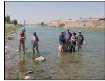
Sample collection on the Chirchik River in Uzbekistan

The Cooperative Monitoring Center (CMC) is well suited and experienced to support the efforts of the U.S. Government to increase regional stability and to reduce the frequency of international water-related disputes, conflicts, and possible wars. The CMC brings technical and political experts together to develop international cooperative international science-based projects with regional stakeholders. Current CMC initiatives on environmental and water issues include: