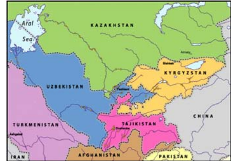
Five nations in Central Asia share the critically important water resources of the Aral Sea Basin.

Access to fresh water is a critical international security issue. Experts predict that by 2015 nearly half the world's population—more than three billion people, mostly in Africa, the Middle East, South Asia, and China—will lack adequate access to fresh water. Agricultural, industrial, and municipal demand for water in many regions already outstrips supply. Severe water-related stress—caused by inadequate supply, pollution, and the lack of transboundary management—limits economic development, jeopardizes public health, and exacerbates regional tensions. Besides the importance of water to international peace and security, the U.S. has strategic interests in many water stressed regions around the world. Examples include: