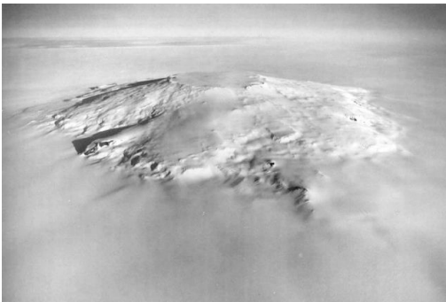
Coordinates: 76.2 °S, 112°W

( http://geonames.usgs.gov/pls/gnispublic/f?p=105:3:8597733731996127::NO::P3_ANTAR_ID:14967 )