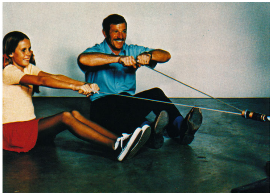
Using the Exer-Genie, father and daughter demonstrate the teamwork approach employed in group conditioning. The Exer-Genie offers more than 100 basic exercises and variations.

Exer-Genie and the Apollo Exerciser have made remarkable impacts on the physical fitness world in a relatively short time—and interest is still on the upswing.