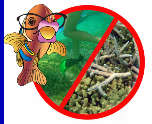
Message brought to you by the Guam Coastal Management Program