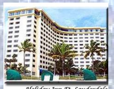
Holiday Inn Ft. Lauderdale