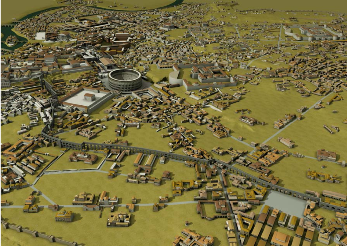
Figure 3. View of Rome Reborn 1.0 from above and from the south. In the center is the Colosseum; to the left, the Temple of the Divine Claudius to the right, the Baths of Trajan. The Baths of Diocletian are seen in the upper right. At the top is the Tiber River. Running through the middle ground of the image is the Claudian Aqueduct.