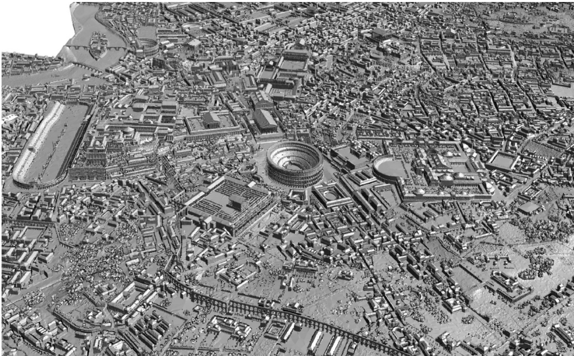
Fig. 1: The point-cloud resulting from scanning the Plastico di Roma Antica. Clearly seen are the Circus Maximus, Colosseum, Temple of the Divine Claudius, Baths of Trajan, etc. When, in the next step of postprocessing, the mesh was made, it turned out that these