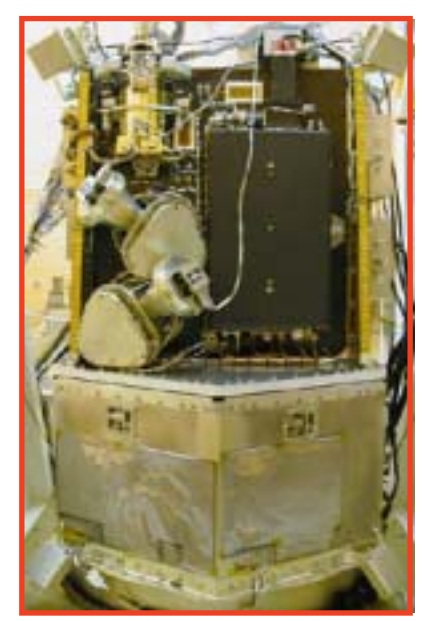
SORCE during integration and test