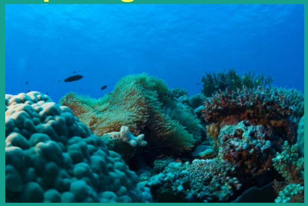
International Year of the Reef Mini-Summit