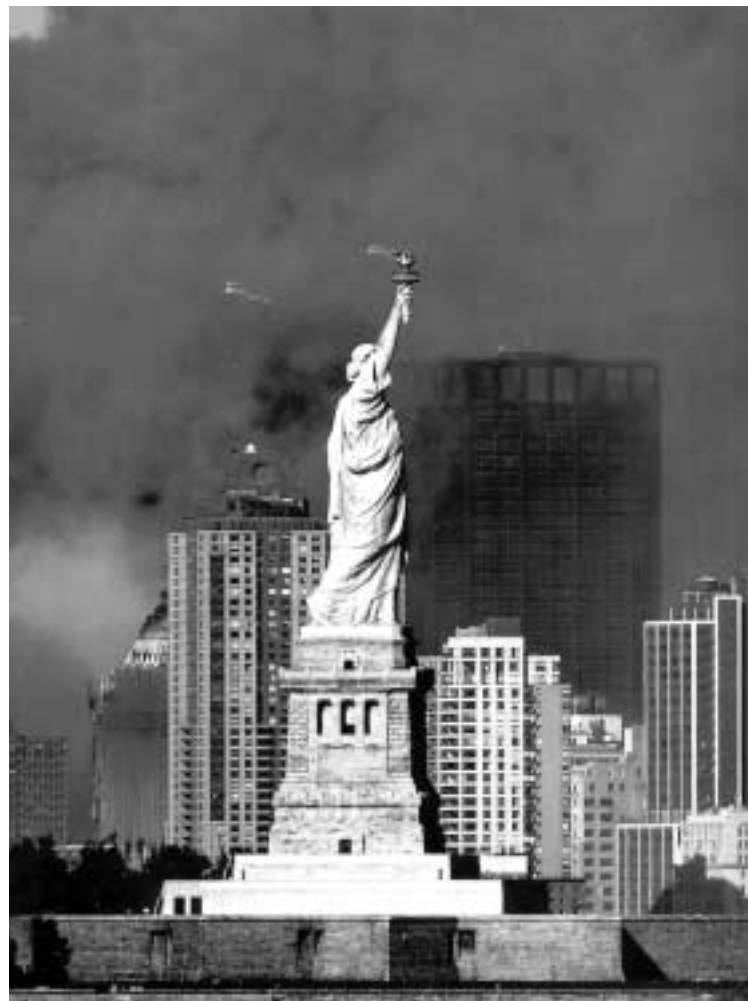
Photo from back cover of TIME magazine special issue produced in the first 24 hours after the Sept. 11 attack.

this until four days later, after we had learned it was not Continental. If I had seen this on the day it happened, I would not be here because I would have LOST IT! Because both our parents are deceased, we are very, very close and I am sure many can understand why. I would make it