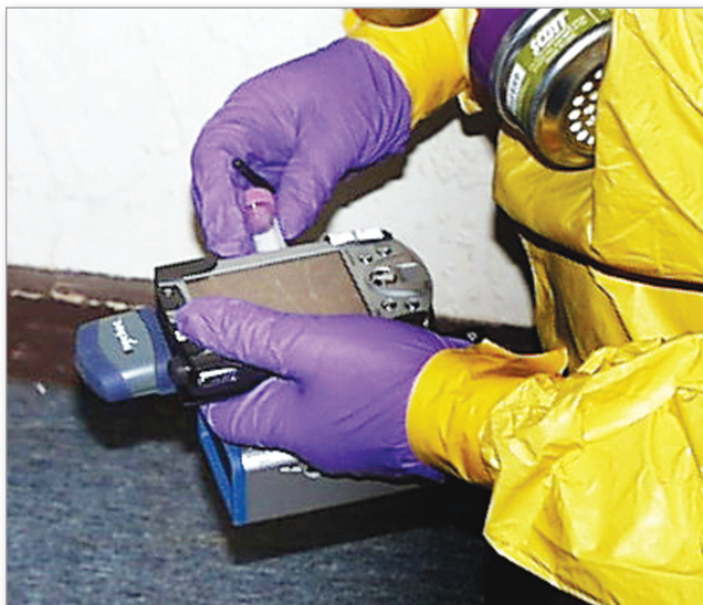
The BROOM system simplifies the process of collecting and processing the many samples needed to restore a facility after a biological attack.

To aid in attack attribution, Sandia and other laboratories are applying advanced techniques to extract as much information as possible from the physical and chemical traces contained in biological evidence—traces that hold clues about when and where an agent was produced. When fully developed, Sandia's palette of techniques will help others identify and attribute signatures in field samples.