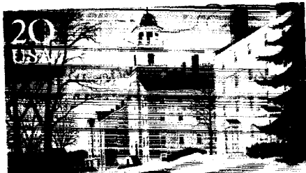
Old Stone Row, Middlebury College, Vermont