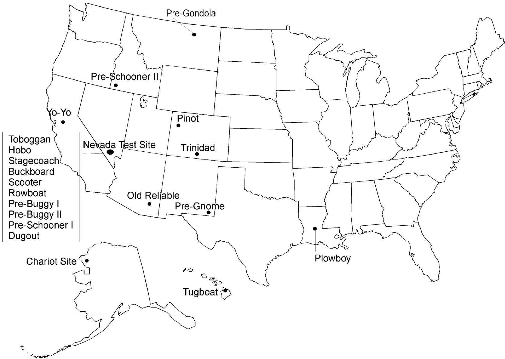
Figure 3. Plowshare Non-Nuclear Experiment Locations.