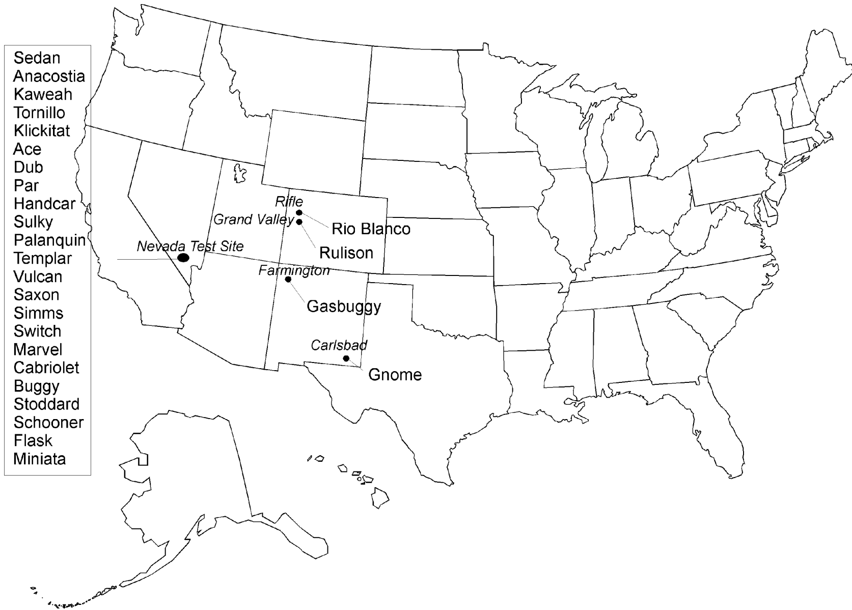
Figure 1. Plowshare Nuclear Test Locations.