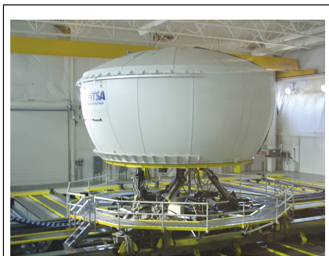
Drug Discovery Today: Technologies

Letter contrast sensitivity [10,11] (Fig. 2b) is similar to low-contrast acuity in that the patient's task is to read as