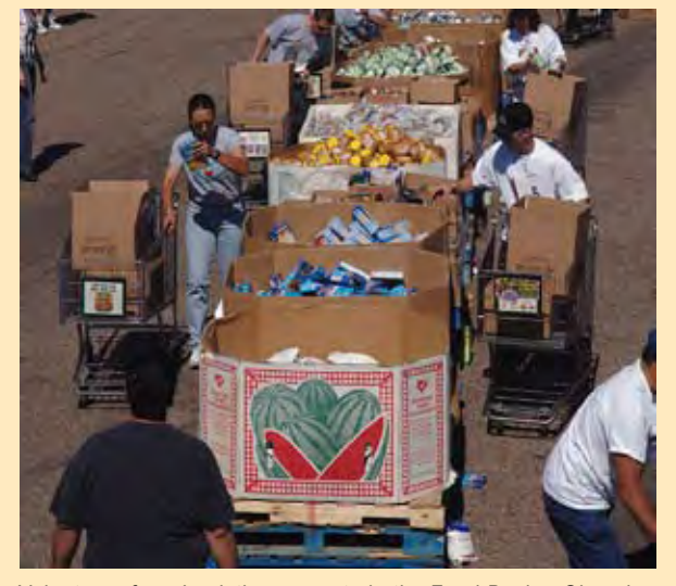
Volunteers from Logistics compete in the Food Boxing Olympics

Feeding New Mexico's hungry is the year-round mission of Roadrunner Food Bank. Sandia National Laboratories/Lockheed Martin provides year-round support. The year began with a $10,000 corporate donation. Corporate food drives brought in 23,000 pounds of food, including 120 turkeys in celebration of Take A Turkey to Work Day. Volunteers stepped in to sort food at the Mail Carrier's Drives and Sortin Sundays and to staff the Souper Bowl fundraiser. Finally, a Sandia team participated in the first annual Food Box-ing Olympics, a competitive event resulting in the packing of 572 special diet food boxes for seniors.