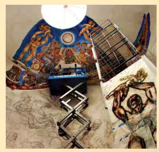
Lockheed Martin has contributed $100K to the National Hispanic Cultural Foundation over a 3 year period.

Lockheed Martin Corporation on behalf of Sandia National Laboratories donated $2.3M to non-profit organizations in support of programs benefiting the Middle Rio Grande Community during 2005. The focus of contributions is on projects and programs that encourage the development of youth in our community so that the next generation workforce is skilled, educated, and maintains values important to our community. Grants are made in five areas which include Education, Arts & Culture, Civic and Public Interest, Health & Human Services and Volunteerism. Examples of some of the 169 supported programs include local museums educational programs, mentoring programs, literacy programs, science and math competitions, music programs in schools, teacher professional development and the Albuquerque Tricentennial Celebration. Organizations interested in applying for Lockheed Martin / Sandia National Laboratories corporate contributions can find more information on Sandia's Web site at http://www. sandia.gov/about/community/index.html.