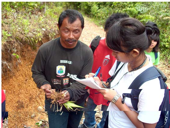
GCE students researching the environment around the National Park.