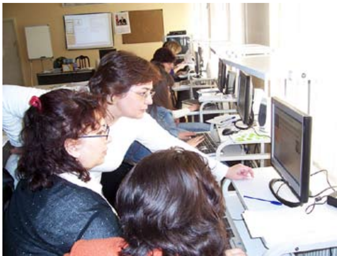
Teachers at the second National GCE Workshop.

In Step by Step, the fourth project, students will volunteer to help disabled children at the hospital. They have already started training with the doctors will soon provide support and get the youths involved in GCE projects such as "Your Dreams" and "Your Vision of the Future" to connect them with their peers in the US and around the world. The fifth project will help create an English Language Resource Center for a primary school to provide a place to develop students' language abilities to increase the number of students able to take an active part in the GCE program.