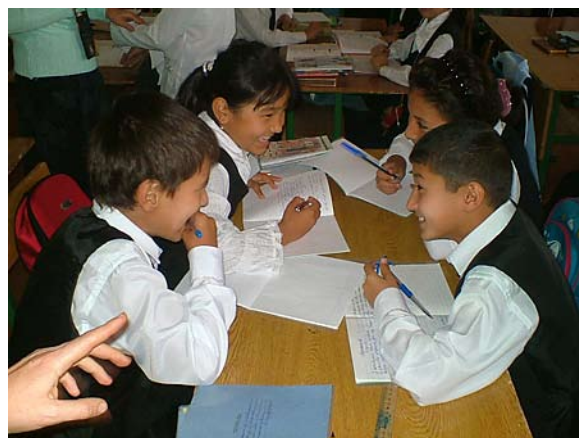
Students at a GCE activity in Fergana discussing ways to prevent terrorism.