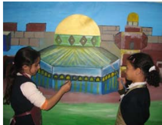
Picture of GCE students working on the Art Miles project on a new website designed by schools in Jerusalem to present GCE projects: http://www.silwan.net/Default.aspx?tabid=215

tive online forums and project based learning provide students with the opportunity to use English meaningfully. The teachers also discovered how participating in the GCE program promotes group work and cooperation, develops self-esteem, trains students to accept constructive criticism and respect the opinions of other, promotes awareness of global issues, and develops effective cross cultural communication skills.