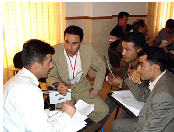
Teachers at the first ever National GCE Workshop in Iraq.

At the end of the workshop, teachers filled out an evaluation for the Ministry of Education (MOE) that was highly positive, resulting in congratulations from the Minister and a joint effort with the MOE to deliver this workshop to teach-