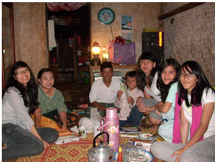
GCE students spending the evening with their host family.

government, National Park staff, local NGOs, and the local community around the Park in order to carry out this ambitious and groundbreaking activity. By working together they have shown the power of youth led community service supported by GCE mini grants, and are looking forward to when they will be able to complete another service project.