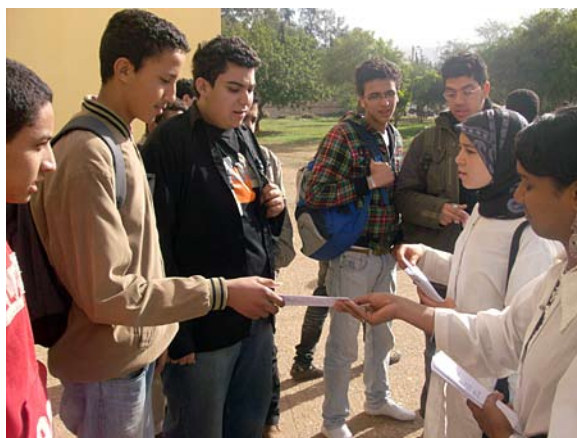
GCE students passing out leaflets about School Dropout as part of the Students Unlimited project.

The students have been sharing their work at each stage of the project in iEARN's online collaborative forums, from plans for the project, to posting essays and materials they created, to sharing photos from their various activi-