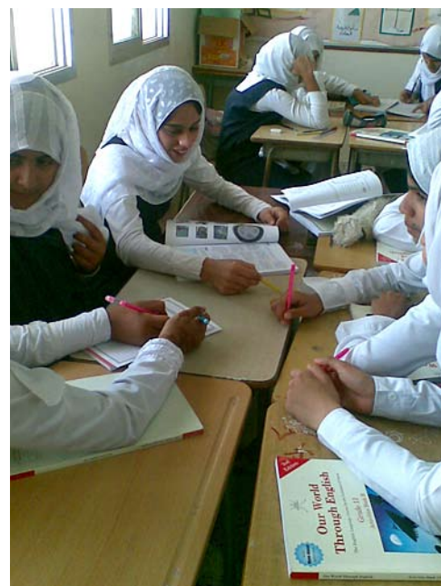
GCE students at the Atika School in Saham participating in the Moving Voices project.