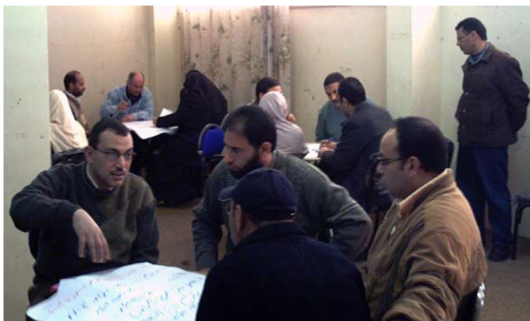
GCE teachers learning about project-based learning at the National Beginners Training Workshop.

School, Aga Secondary School for Girls, Talkha Secondary School, New Mansoura Secondary School for Girls, and Sherbin Secondary School for Girls.