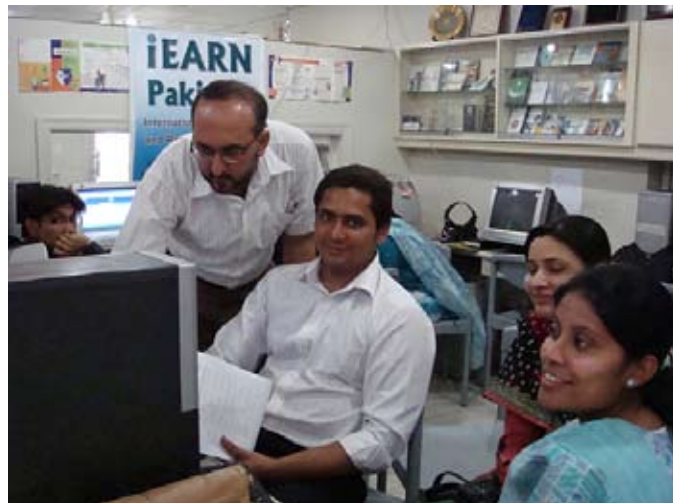
Teachers exploring the online collaborative forums they will be facilitating at a GCE workshop.

Service, Folktales, Water Habitat, and Laws of Life. iEARN-Pakistan developed a project facilitator's guide that will be helpful to educators currently facilitating projects as well as educators facilitating for the first time. This is the first time that the roles and responsibilities of a project facilitator have been written down in a manual, and this document will be shared with project facilitators globally to comment and amend so that there will be a