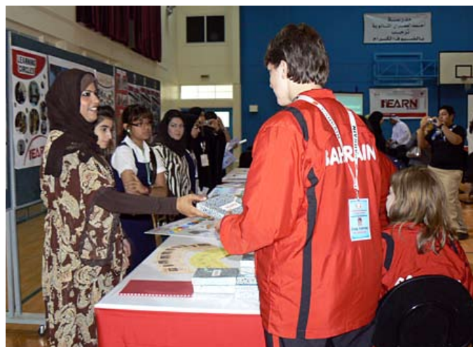
GCE students and teachers presenting their work on the GCE program to the MIUSA delegation.

A group of disabled American youths arrived on March 11, 2008 to take part in a three-week exchange program. The 2008 US/Bahrain: Youth Citizenship for Disability Inclusion Exchange Program is administered by MIUSA and sponsored by the US Department of State, and brings together a diverse delegation of young leaders, aged 15 to 17, with and without disabilities, from the US and Bahrain. During their stay in Bahrain, the delegation participated in a