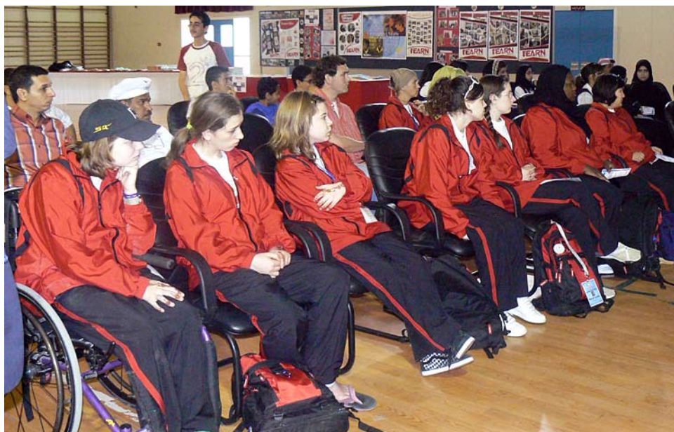
The MIUSA delegation attending a presentation of the GCE program at a secondary school in Bahrain.

iEARN-Bahrain organized a visit by the MIUSA delegation to the Ahmed Al Omran Secondary School on March 24, 2008. The delegation watched a presentation about the GCE program and iEARN in Bahrain, which highlighted the achievements of Bahraini teachers and students, and asked questions about how to get American youth with disabilities involved in the program. The delegation then toured an exhibition organized by four GCE schools that displayed pictures of students working on GCE projects and the final products created by students as part of these projects. GCE students and teachers were pleased to show the MIUSA delegation their work and answer questions, and hope to be able to connect online to disabled youths in the US through MI in the near future. The visit was covered by three local newspapers.