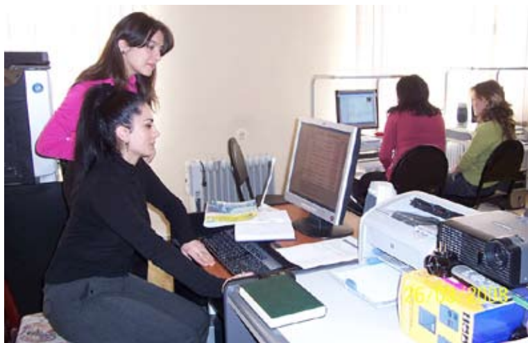
Teachers at the second National GCE Workshop.

GCE students at School #164 in Baku and School #1 in Ismaili participated in the Leap Year Project with 25 other schools from 8 different countries, including 19 schools from 11 states in the U.S. The students observed the temperature, height of the sun, wind speed, precipitation, and weather conditions and then shared their data with the other schools in the project.