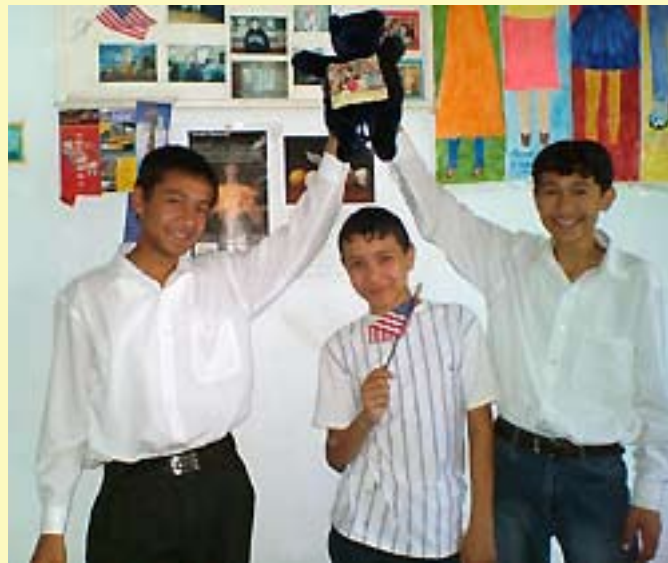
GCE students in Uzbekistan with a teddy bear from Indiana in their classroom's American Culture Corner as part of the Teddy Bear Exchange project.