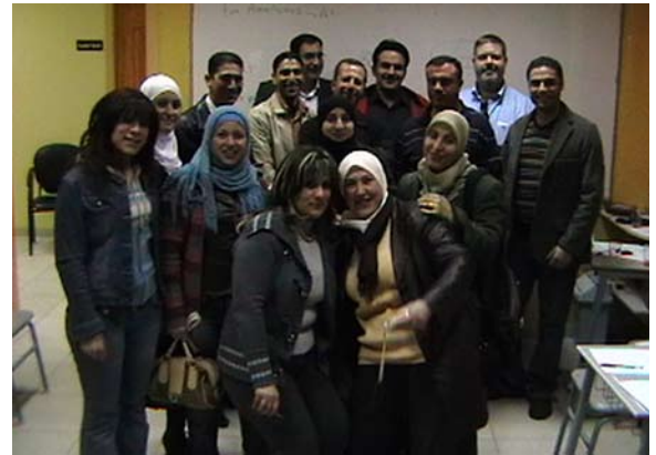
GCE Educators attending a workshop at the Rawafed Center in Zabadani conducted by a Senior English Language Fellow.

The English Language Fellow Program is funded by the U.S. Department of State and sends experienced educators all over the world for a ten-month period to improve English teaching capacity and to further mutual understanding between