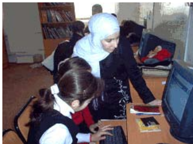
GCE students in Ismaili working on the Leap Year Project.