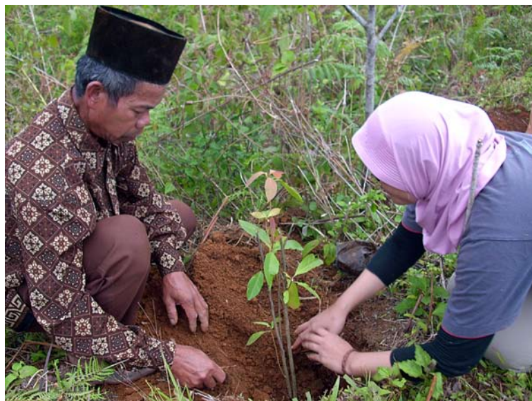
GCE students worked with the community around Mt. Halimun National Park to raise awareness about environmental issues and plant trees.

The team from Al Izhah Senior High School stayed with host families to try to integrate into the community as much as possible. The first two days were spent getting to know the community and raising awareness through education about local environmental problems and the purpose of their project. The third day was spent planting about 400 trees with the villagers. The students and teachers of Al Izhah collaborated with the local