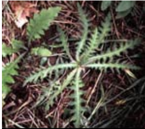
Spiny rosette- circle of leaves close ground

Description: Marsh thistle is an erect herbaceous biennial in the Aster family (Asteraceae) that can grow 4 to 5 feet in height. The stem is winged and spiny, with sparse to fairly dense whitish hairs. Much of the plant is covered in long, sticky hairs. Leaves in first-year rosettes are spiny, long, deeply lobed and hairy on the underside. On flowering plants, leaves are 6 to 8 inches long near the base and shorter toward the top. Flowering stems are erect, thick, and somewhat reddish in color, branched at the top and bristling with spiny wings aligned with the stem. Clusters of (12 or more) spiny purple flower heads bloom in June and July and by late summer produce tiny, hard, elongated seeds attached to feathery thistle-down. Seeds are dispersed by wind.