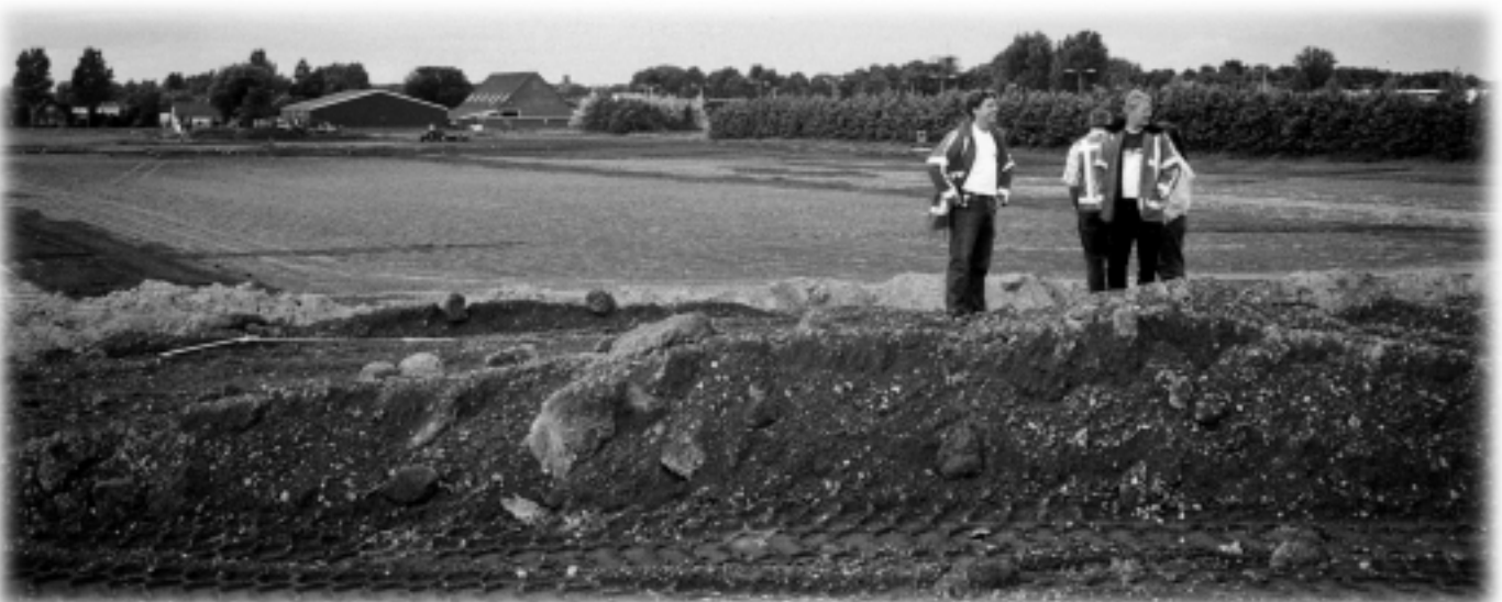
Prior to the workshop, some participants saw how waste-to-energy bottom ash is being used in road embankments in the Netherlands.

Workshop presentations are available online at www.rmrc.unh.edu . A copy of Recycled Materials in European Highway Environments: Uses, Technologies, and Policies is available online at www.international.fhwa.dot.gov . Hard copies are available by sending an email request to the following: Hana Maier (202) 366-6003 international@fhwa.dot.gov