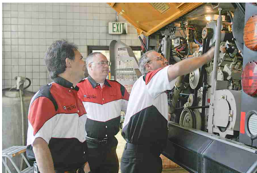
Metro's mechanics win national competition