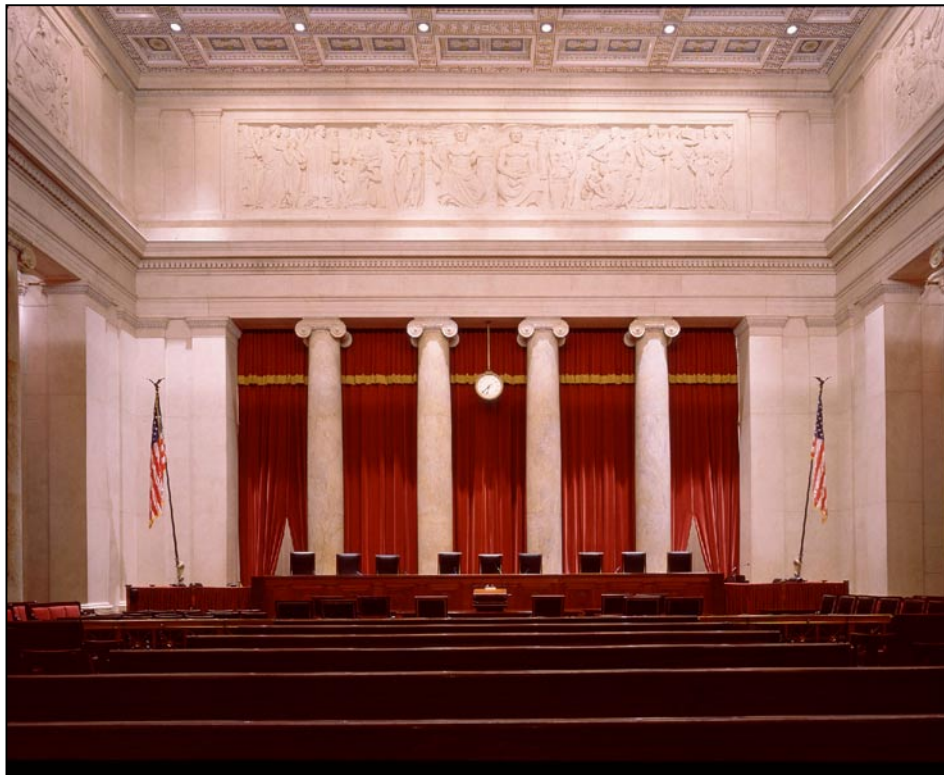
The east wall of the Courtroom, c. 1998, showing the location of the East Wall Frieze above the Bench

Flanking these two figures are representations of Wisdom , to the left, with an owl perched on his shoulder, and Truth , to the right, holding a mirror and a rose. Moving to the left from the central figures are the “Powers of Good” - Defense of Virtue , Charity , Peace , Harmony , and Security . The “Powers of Evil,” moving to the right from the central group, are - Corruption , Slander , Deception , and Despotic Power .