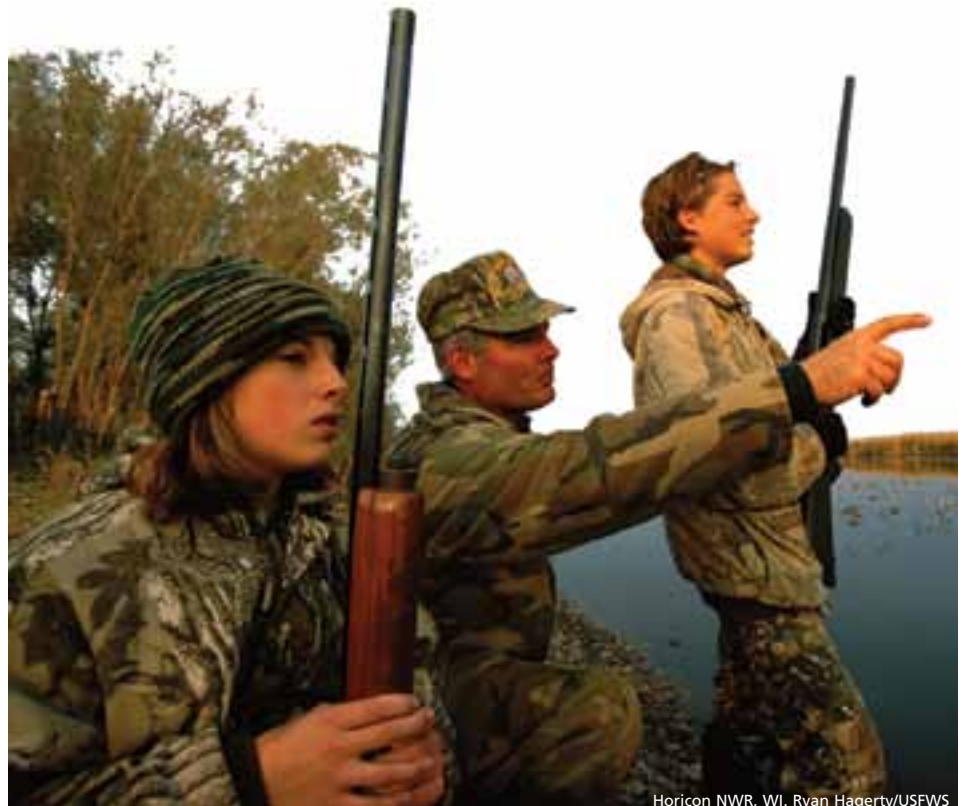
Horicon NWR, WI.