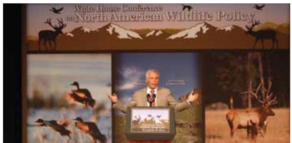
Ed Shafer, Secretary of Agriculture, addresses the conference.