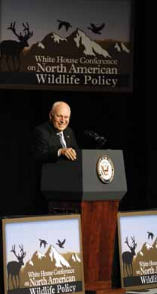
Vice President Richard Cheney addresses the White House Conference.

“The Sporting Conservation Council, which we created in 2006, has proven itself to be an excellent source of insight and good judgment. Congress should formally authorize it for a ten-year term to help us carry out that ten-year plan.”