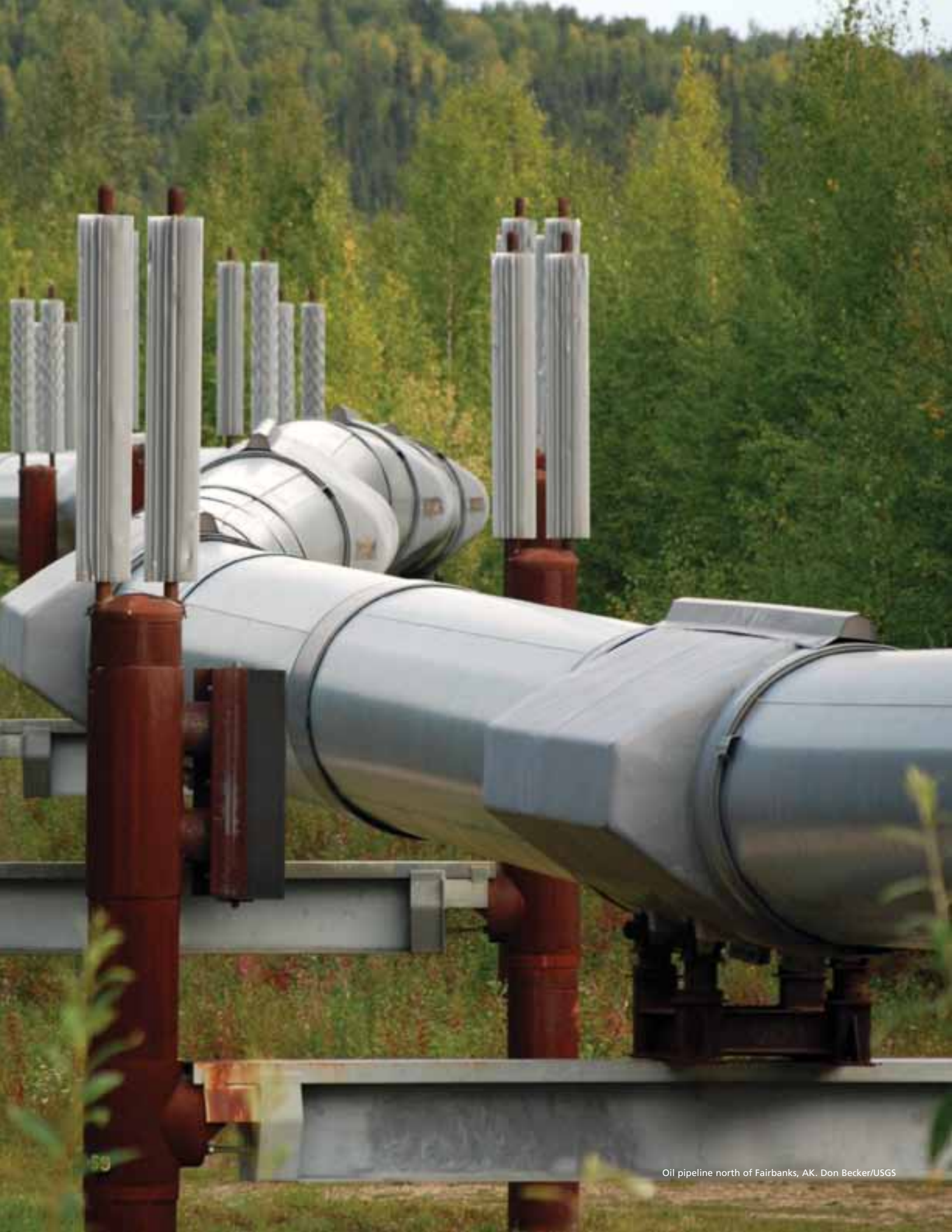
Oil pipeline north of Fairbanks, AK.