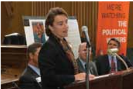
Sen. Blanche Lincoln (D-Arkansas) addresses the Congressional Sportsmen's Caucus briefing on the Action Plan.