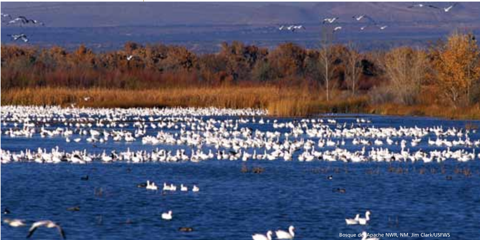
Bosque de Apache NWR, NM.

— Vice President Richard Cheney October 3, 2008