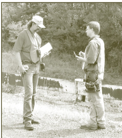
NDEVC observer interviews an inspector just before an inspection task.

Seven of the NDEVC test bridges were used for the 10 performance trials. The NDEVC test bridges are