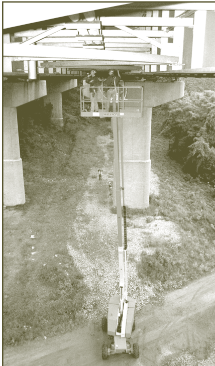
In-Depth Inspection performed with the aid of a lift vehicle. Also note the second observer and inspector performing the Routine Inspector.

tion was collected about these inspectors and the environments in which they worked. This information was then used to study possible relationships of various factors with the inspection results.