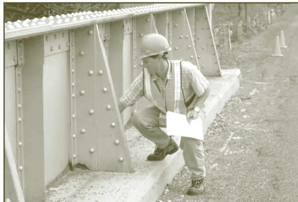
Part of a Routine Inspection at a STAR bridge.

relate with In-Depth Inspection results. In this study, they include factors related to inspector comfort with access equipment and heights, time to complete inspection, structure complexity and accessibility, inspector viewing of welds, flashlight usage, and number of annual bridge inspections. In addition, the overall thoroughness with which inspectors complete inspections tended to have a large effect on the likelihood of defect detection. Not surprisingly, there also appears to be some correlation between the types of defects individual inspectors will note. Specifically, inspectors who find small, detailed defects are more likely to consistently note small, detailed defects regardless of the bridge. Also, inspectors who find gross dimensional defects are more likely to do so on other bridges as well.