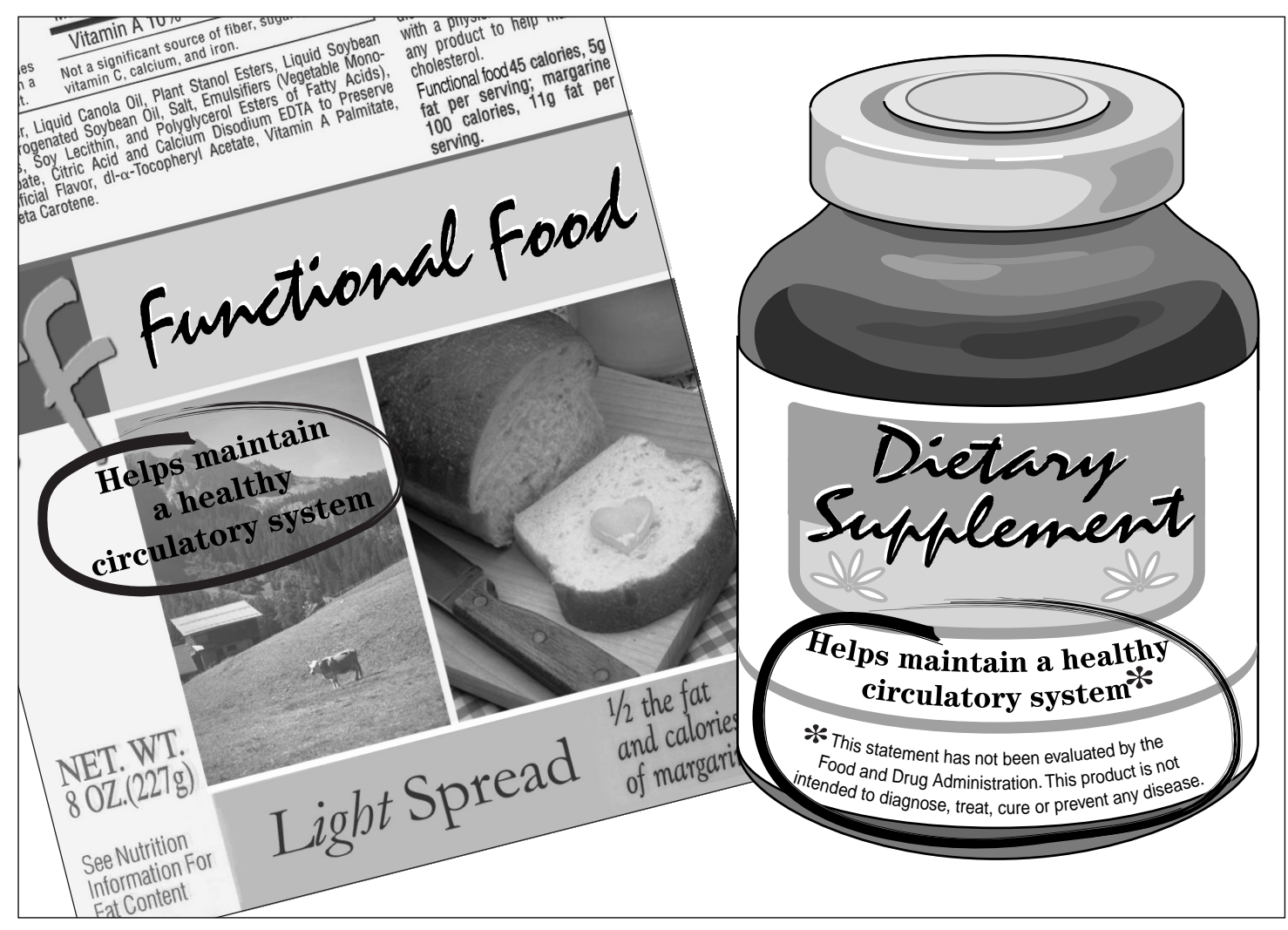
Figure 2: Hypothetical Comparison of Two Products Using the Same Structure/Function Claim—a Functional Food Without a Disclaimer and a Dietary Supplement With a Disclaimer

structure/function claim related to maintaining a healthy circulatory system would have to include the disclaimer on its label, but a functional food containing the same ingredient and claim would not. (See fig. 2.)