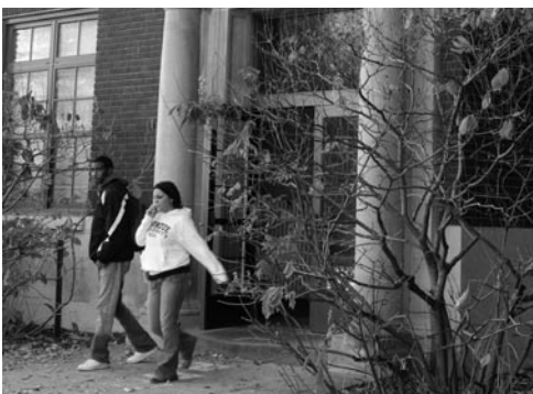
The Recitation Building, built in 1922, features numerous smaller classrooms used to implement the University's recitation-lecture class concept, in which a small-group review/discussion component (recitation) complements a lecture course.

Mutual roommate requests will be honored if possible, as long as each student has signed a contract by May 1.