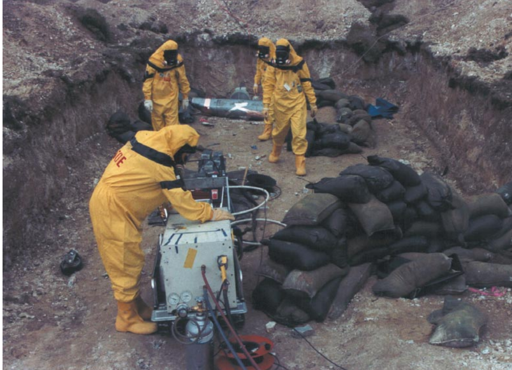
Specialized techniques, such as radiography, are used to examine the weapon's internal structure.

materials. Special containers can be constructed at the accident site for packing damaged weapon parts and debris.