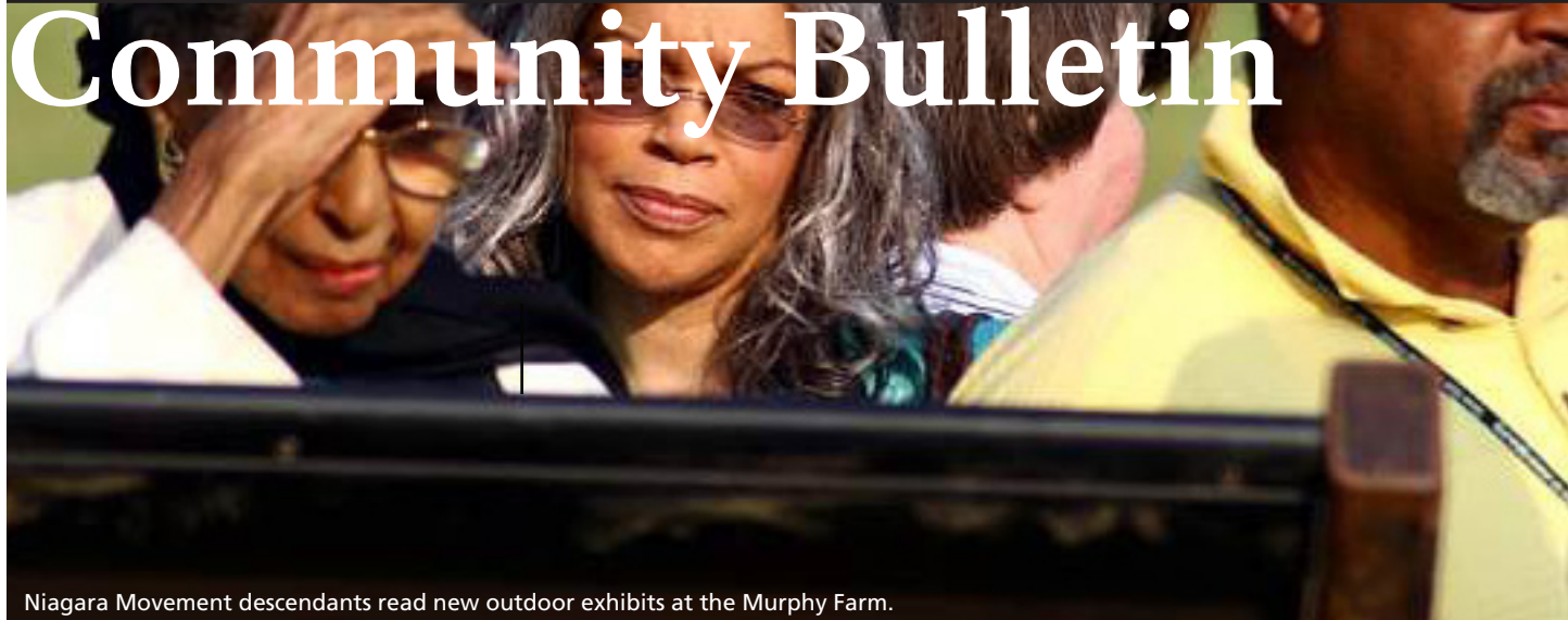
Niagara Movement descendants read new outdoor exhibits at the Murphy Farm.