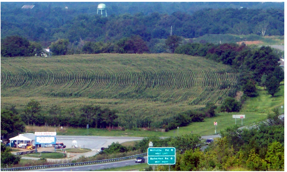
Perry Orchard site where the SCA will construct a Virginia worm fence

For further information on the SCA call 603-543-1700 or log onto the SCA website at http://www.thesca.org/