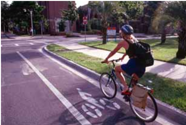
Figure 13-3. Photo. Bicyclist in a bike lane.