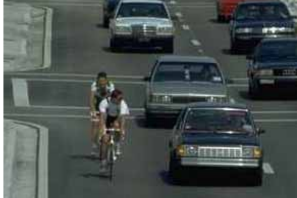
Figure 13-2. Photo. Bicyclists in a wide curb lane.