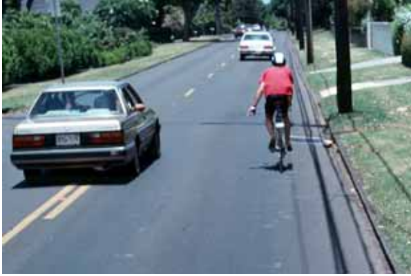
Figure 13-1. Photo. Bicyclist on a shared roadway.