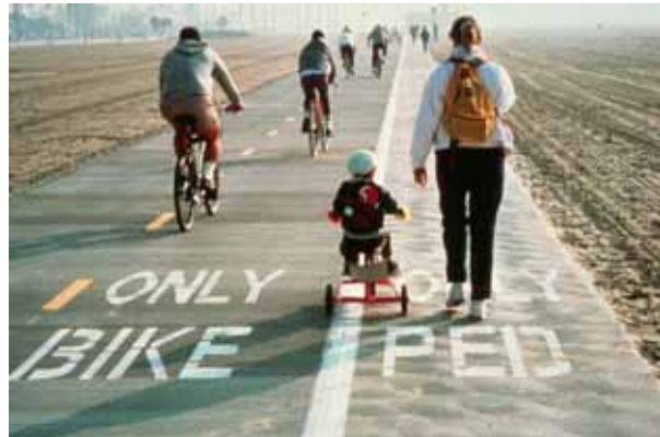
Figure 13-4. Photo. Bicyclists and pedestrians on a separated (shared-use) path.

(These pictures show bicyclists not wearing helmets. The Federal Highway Administration (FHWA) strongly recommends that all bicyclists wear helmets.)