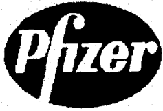
(MUSIC/SINGING IN) FEMALE ANNCR: Pfizer.

LENGTH :15 STATION WNET DATE 02/10/00 TIME 8:03 AM