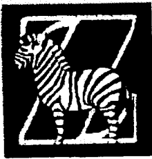
Pfizer brings parents the letter Z