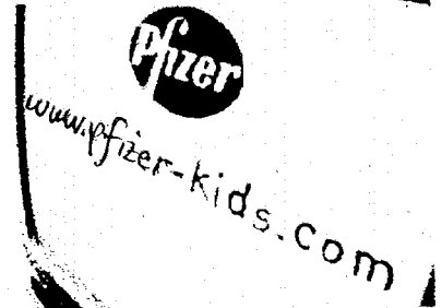
is just a click away. Pfizer. Life is our life's work. (SINGING/MUSIC OUT)

SUPER: (SZITHROMYCIN* FOR ORAL SUSPENSION)